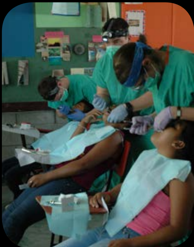
Location: El Progreso, Honduras

PODEMOS is a joint effort volunteer organization from the medical, pharmacy, and dental schools at The Ohio State University. The collaborative endeavor seeks to provide international help to less fortunate individuals and families who do not have access to dental and medical care.