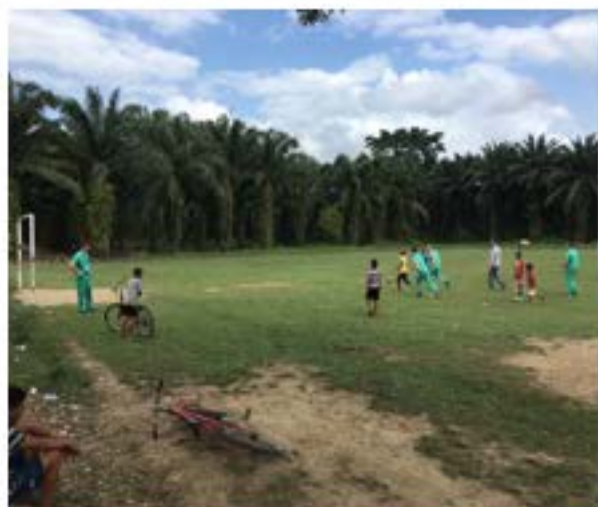
Playing soccer with the local kids