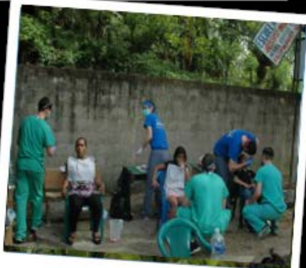
Outdoor dental setup in the mountains