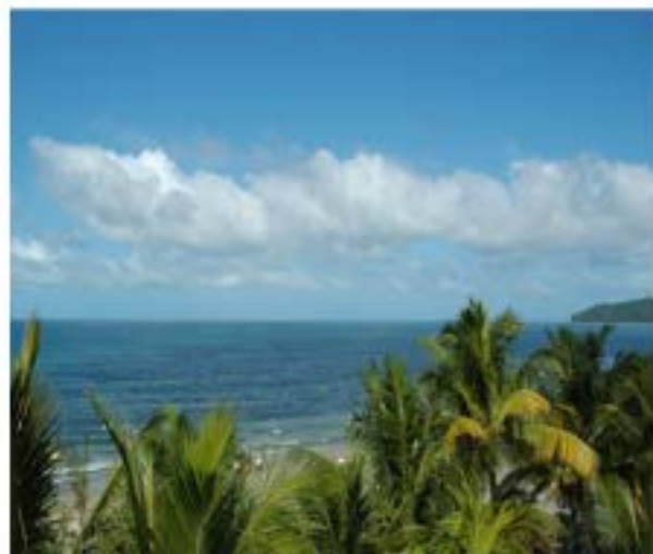
New years day on the beach in Tela