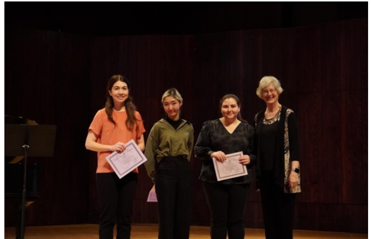
2023 Young Artist Division Finalists