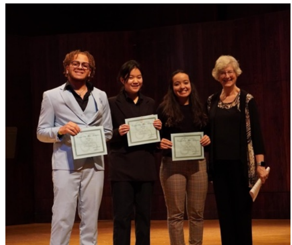
2023 Senior Division Finalists