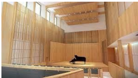
Inside the recital Hall in the Timashev Music Building

We are thrilled to be hosting our forty-first annual flute festival of the Central Ohio Flute Association. This year, we will be able to celebrate in person again on March 2nd, 2024 in the Timashev Family Music Building on The Ohio State University campus which just turned one year old! We are so fortunate to be able to use these beautiful facilities for this year's festival. We are so grateful to all those who have been involved with and supported COFA over the years and are looking forward to seeing you back in the Timashev Music Building in March.