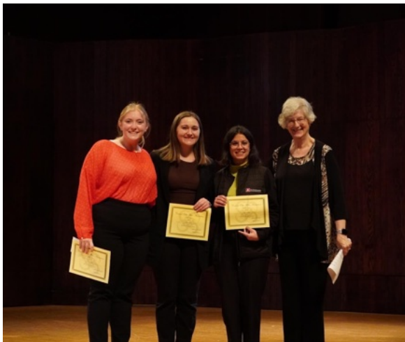
2023 Collegiate Division Finalists