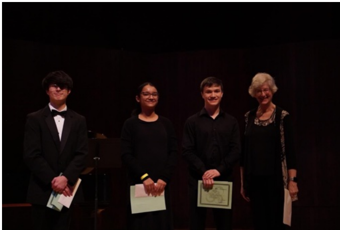
2023 Junior Division Finalists